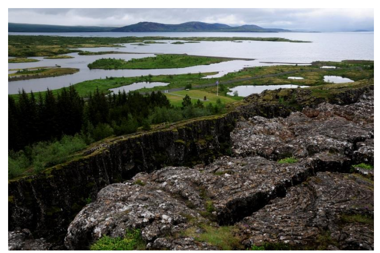
https://www.extremeiceland.is/en/information/about-iceland/geysir-geothermal-field http://gullfoss.is/ http://www.ancient-origins.net/ancient-places-europe/ancient-parliamentary-plains-iceland-001926

The capital of Iceland, Reykjavik , according to a legend, was home to the first settlers arriving in 874 AD. Today, almost three out of four Icelanders, live in the capital. In case you like exact figures, a real time counter of population is presenting this number in a popular restaurant in downtown. A wonderful bird's eye view of the capital offers the tower of the Lutheran Hallgrímskirkja church. 73 metres high, it is the largest church in Iceland and among the tallest structures in Iceland. An introduction to your visit to Iceland offers the presentation in the new modern Harpa located close to the sea. It is exactly the place where probably half of local population as well as visitors celebrated the surprising result of football match during European championship. Really