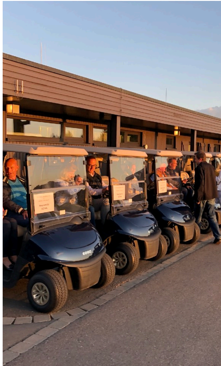
Professional Buggy fleet with Course Guide