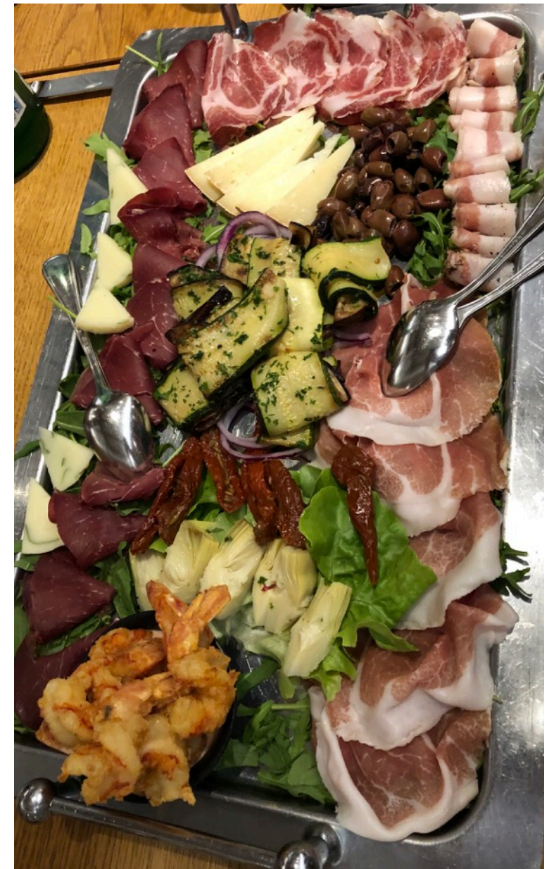
The Antipasti in the Hexenweier was particularly tasty and combined with some wine, fantastic to share after a round golf.