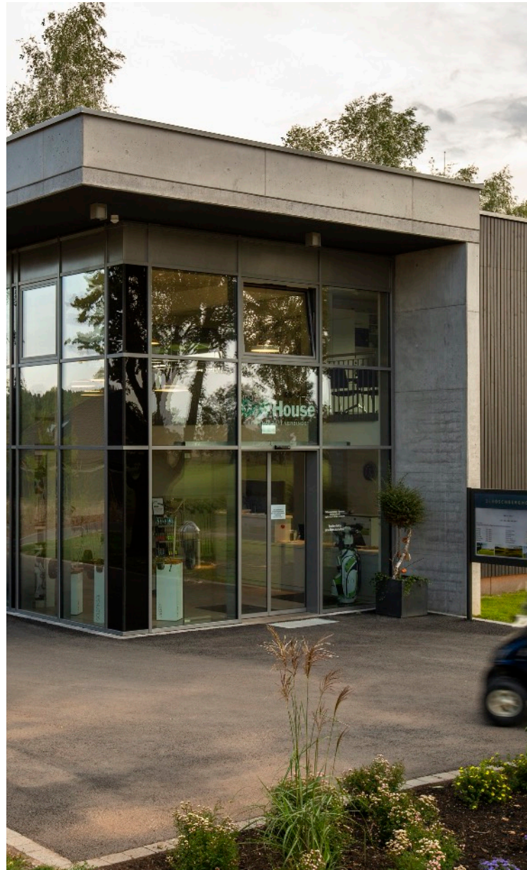
Golf Academy with professional club fitting