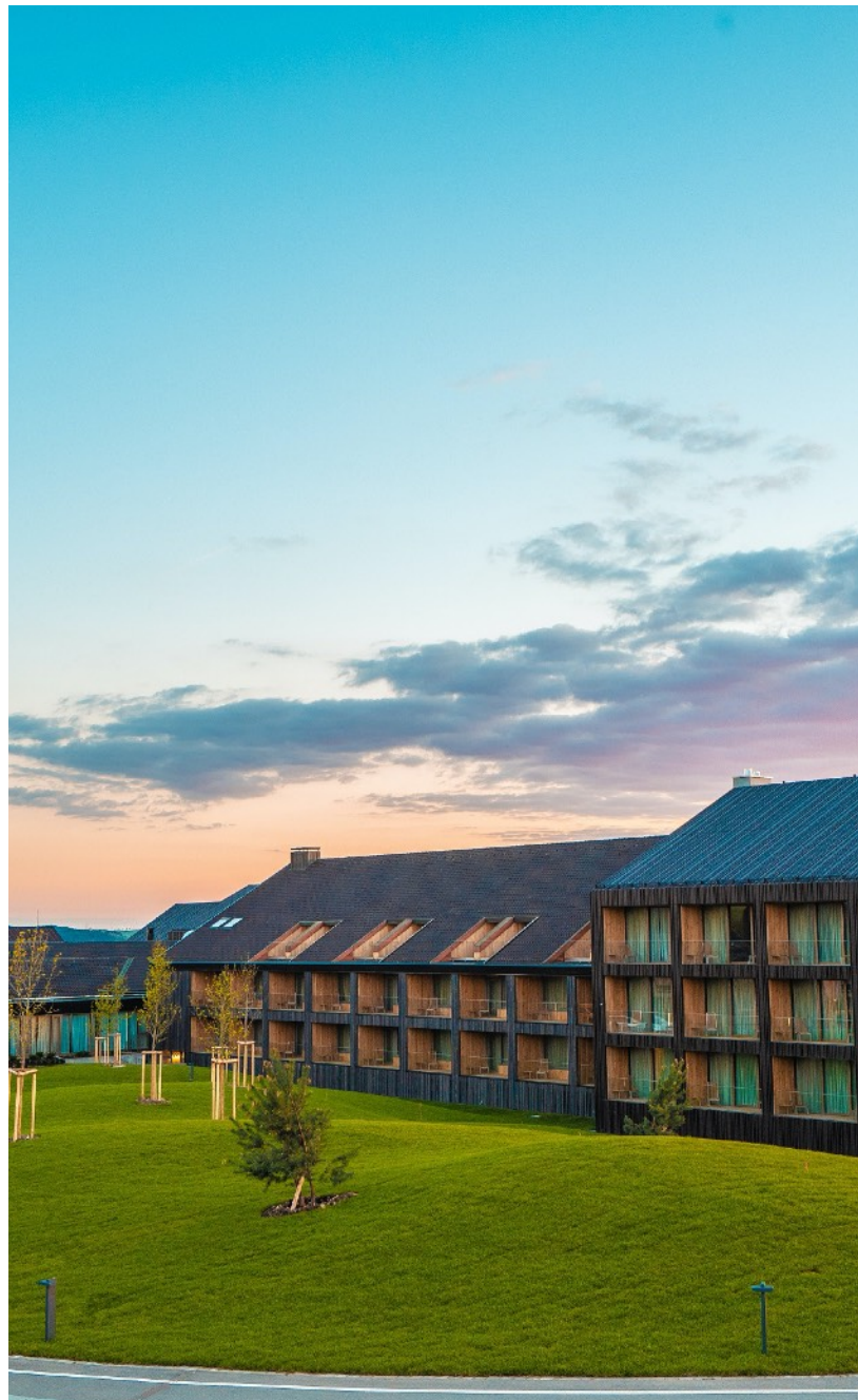
Deluxe accommodation with a sumptuous decor and attention to detail.