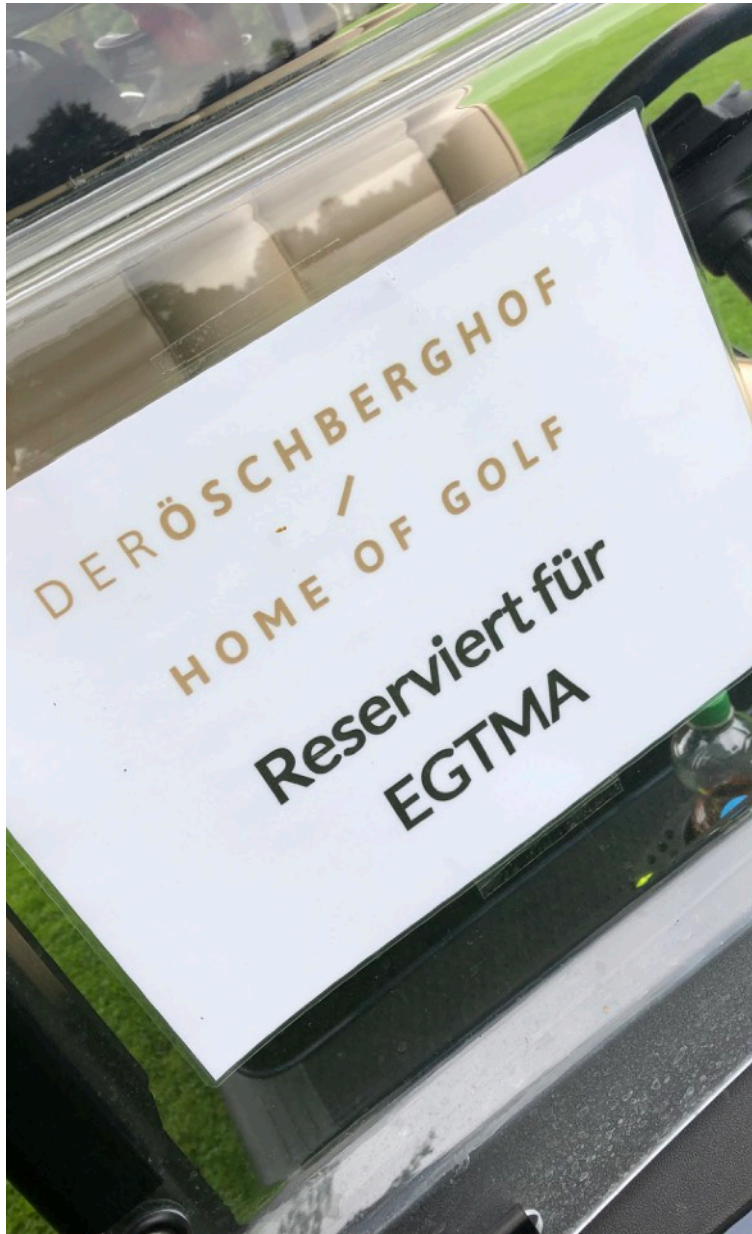
EGTMA members enjoying the attention