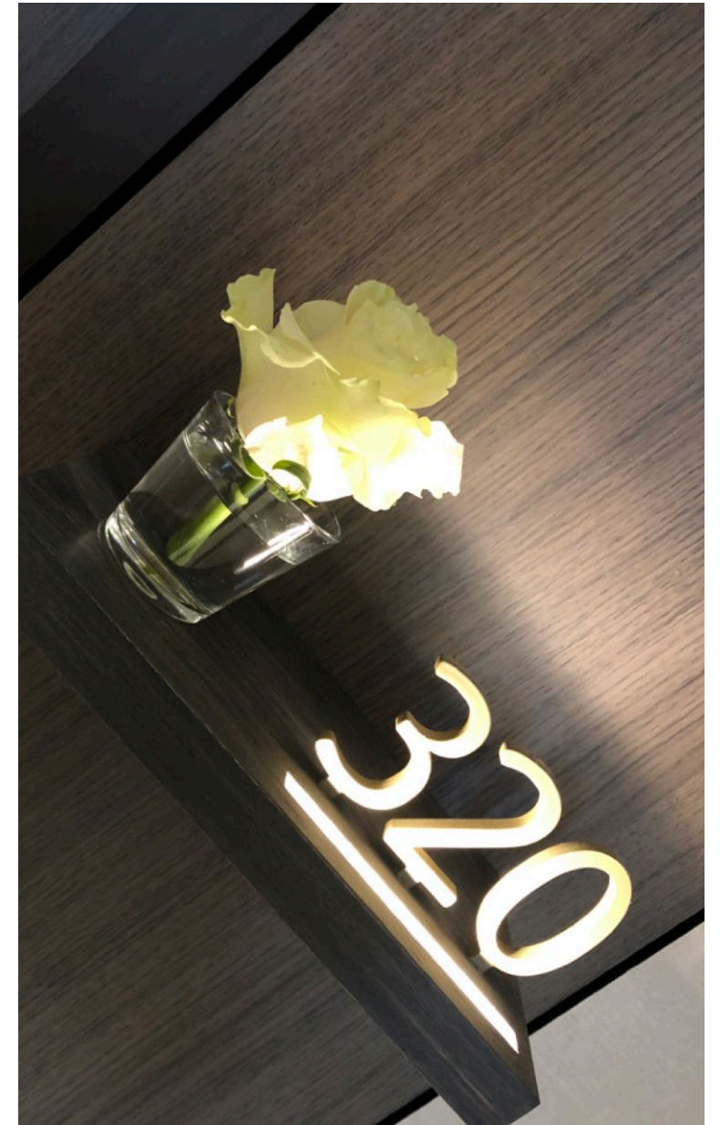
Attention to detail